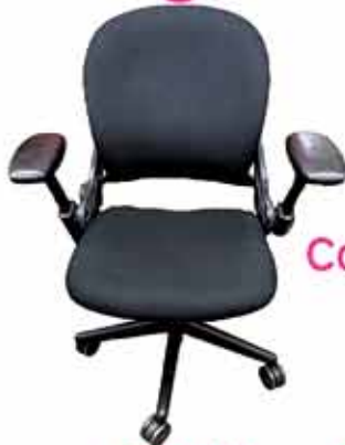
Steelcase V1 Leap Chair