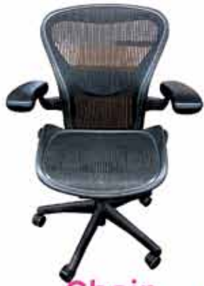
Herman Miller Aeron Chair