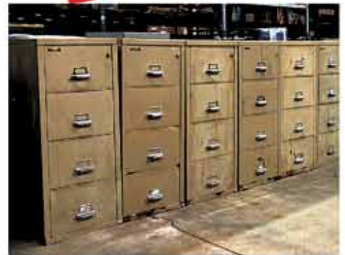
Metal Fire Files starting at $499.00